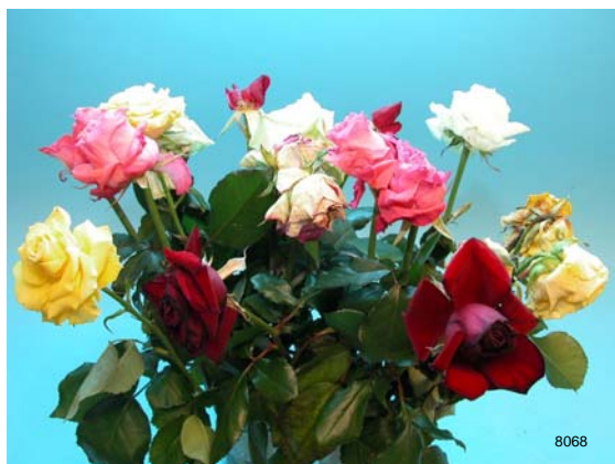
Treatment: water Total vase life: 8 days Photo taken: day 15