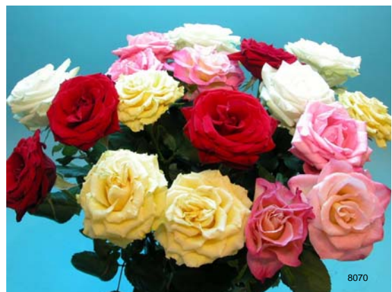
Treatment: Chrysal Clear Rose powder Total vase life: 19 days Photo taken: day 15